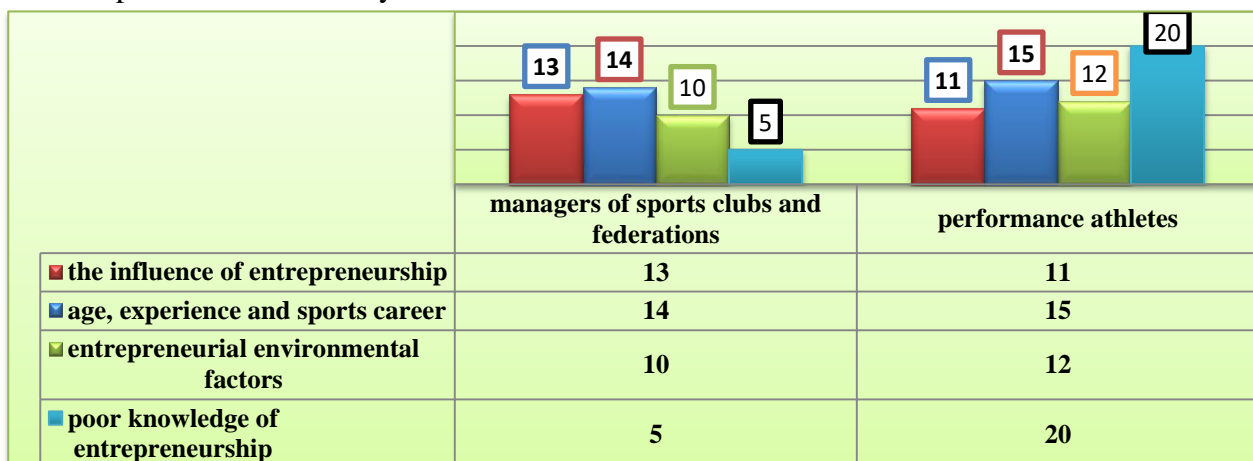
Fig. 1. Answers on the factors that could influence the decision to set up a business in the field of physical culture

To the question "Do you know what are the factors that could influence the decision to set up a business in the field of physical culture", most categories of respondents mentioned that among them are: increased influence on entrepreneurship education and studies (24%), age, work experience and sports career (29%), etc.; entrepreneurial environmental factors: economy, sources of financing, consultative assistance, support staff, legal conditions and business organization in the field (22%); poor knowledge in the field of entrepreneurship (25%), especially in terms of location, market sector, skills required for the selected field of activity, etc.